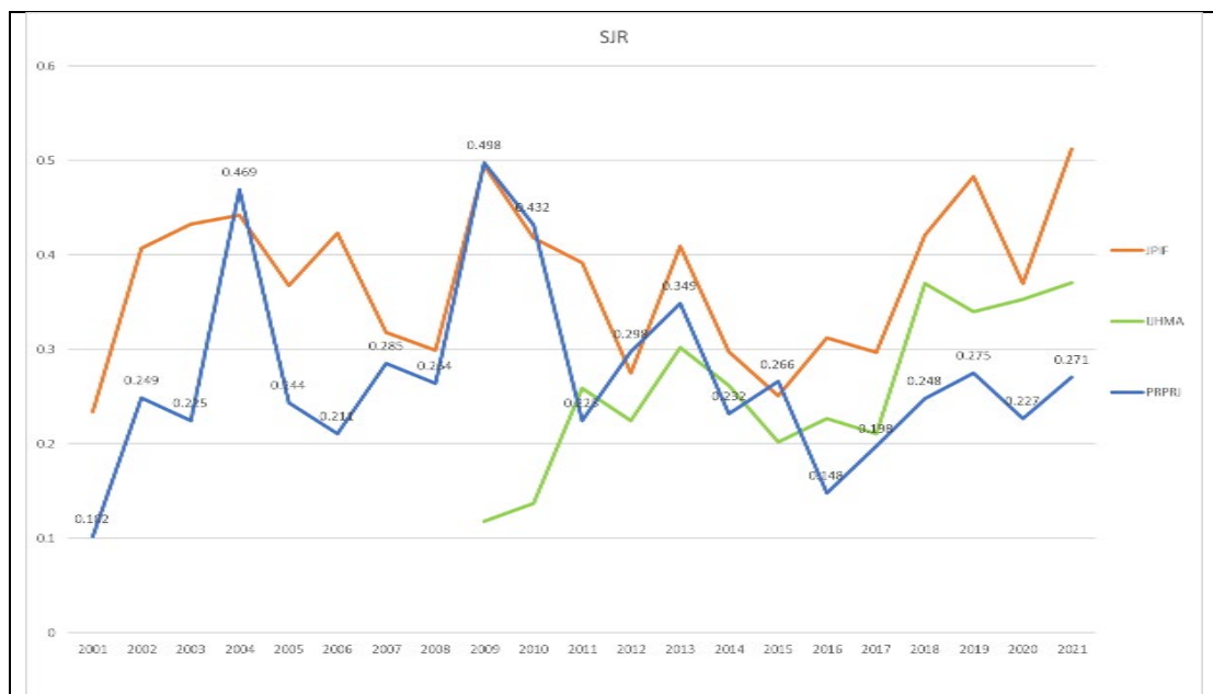
Figure 1a. SJRs of PRPRJ, JPIF and IJHMA, 2001 - 2021. (Source: SCImago, 2022a)