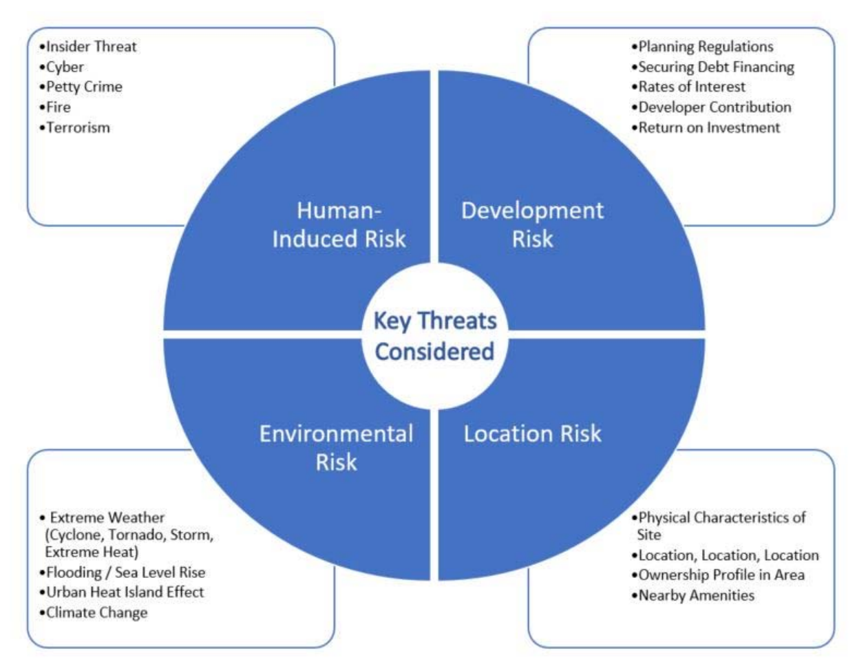
Figure 1: Main Threats Considered in the Real Estate Development Process

Two clear and distinct themes emerged in response to questions related to participants' current considerations of the breadth of threats during the development process. The majority of the interviewees were heavily influenced in their decision making by what they were mandated to consider (e.g. via building codes, fire safety requirements, CPTED), and by client requirements. A smaller group of participants discussed an 'all threats & hazards' approach in their decision making. The reasoning presented for taking this approach varied based on the location of the development, the type of development (government, transport hub, stadia, shopping malls, health care), was influenced by whether a security consultant was used (either in-house, or external) in the early stages of the development, and whether there was a mature organizational security culture in the client organisation that was driving the involvement of other involved organisations. Common threats identified across the stakeholder groups fell into four key themes (see Figure 1):