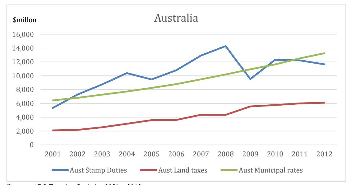
Figure 2: Comparison between tax revenues from land taxes and conveyance stamp duty Australia

In contrast to other OECD countries Australia has capacity to improve its tax effort derived from recurrent land taxes, particularly in light of its overall lower ranking in total taxes collected. This provides an opportunity for the States to progressively increase land tax while reducing conveyance stamp duty and marginally increase their total tax effort as a percentage of GDP and as a percentage of total tax collected.