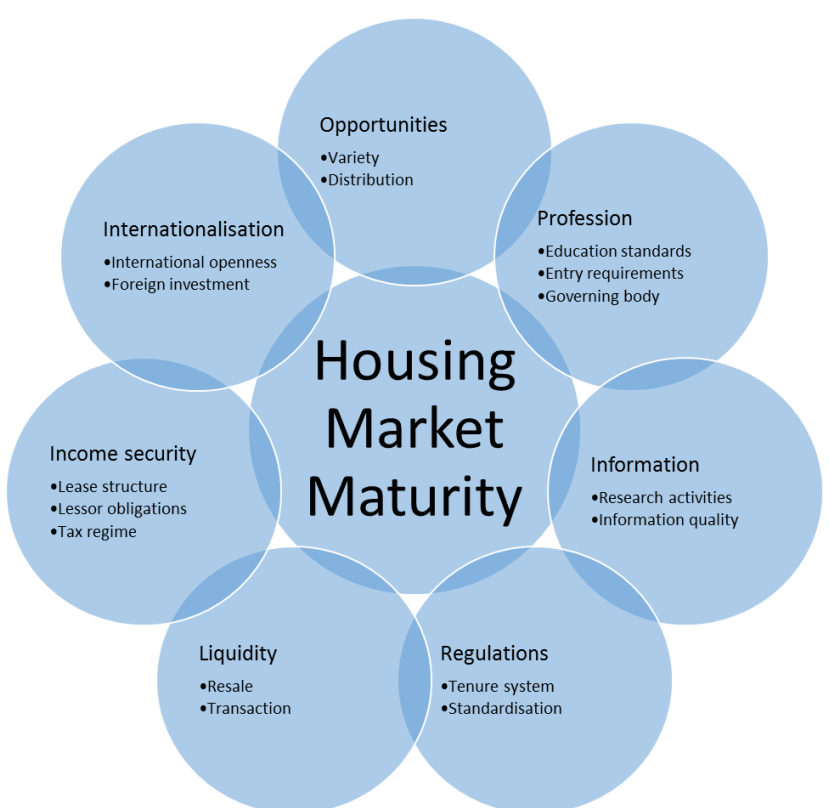
Figure 1: Conceptual Framework of Housing Market Maturity (Khanjanasthiti et al., 2017)

Figure 1 synthesises the findings from the literature review above into a holistic, original housing market maturity framework.