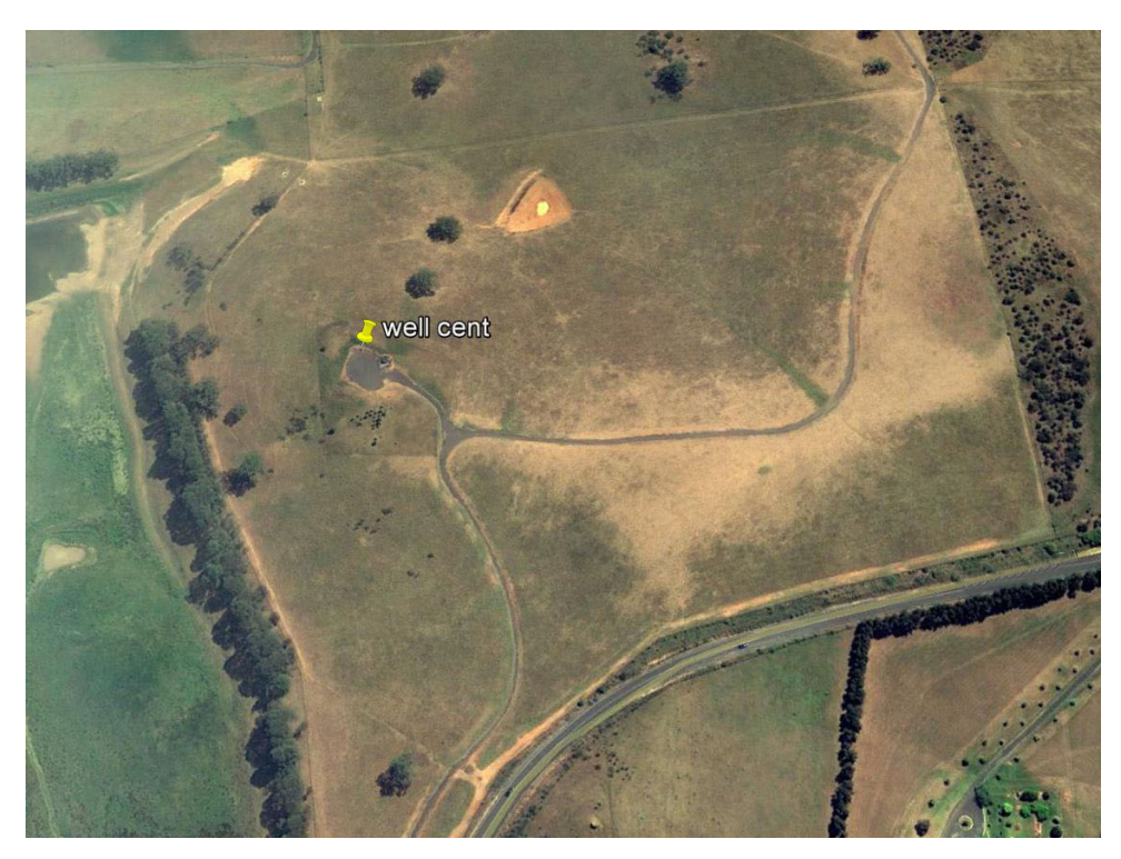
Figure 3 Wellhead and access roads at Menangle c 2007 (road curves east to northeast to serve additional well)

Brown 2009, 166, reinforces this understanding of the operation of the term severance.