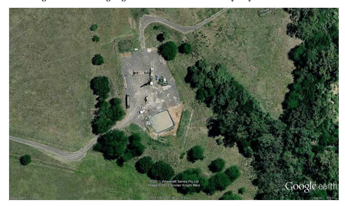
Figure 2 Well undergoing maintenance south western Sydney NSW circa 2007

The dewatering process has raised concerns about contamination of farmland with brine (Australian Senate Interim Report, 2011, 16). Figure 2 shows a well (apparently undergoing maintenance) near Camden in NSW with small dam located just south of the well.