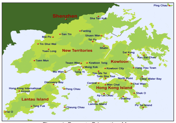
Figure 4: Property B Location Map

Property B is located within the Tsuen Wan District, New Territories. The Tsuen Wan District is situated near the old town centre, the West Rail Tsuen Wan West Station, ferry and bus terminus and a number of newly developed residential towers. While heavy traffic flow has been identified as a weakness of the property, it is still easily accessible to a number of major trunk roads. The property is linked with a number of roads leading to the northern parts of New Territories which links to the highway, container terminals in Kwai Chung and the Chek Lap Kok Airport. The location of Tsuen Wan is illustrated in the map in Figure 4.