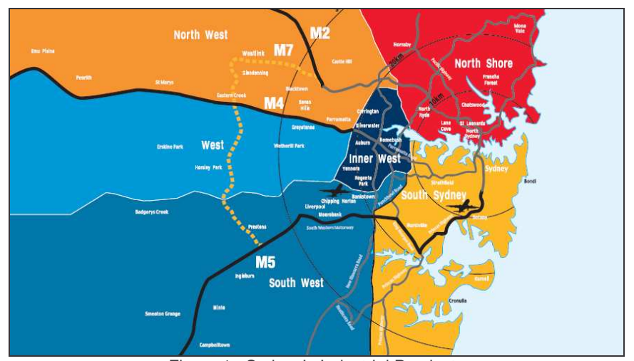
Figure 1: Sydney's Industrial Precincts

The Sydney industrial property market consists of seven main precincts, as illustrated in Figure 1. This map was provided by Colliers International (2006) and also indicates the major infrastructure roads running throughout Sydney. It is evident from this map that Sydney's major infrastructure is well developed and provides sufficient access to all seven industrial precincts.