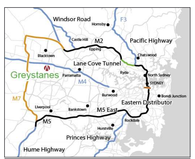
Figure 5. Property A location map

Property A is located approximately 29 kilometres from the Sydney CBD (see Figure 5). Surrounding developments include modern distribution and manufacturing facilities all benefiting from the location of Greystanes. The property has sound access to a number of major transport routes.