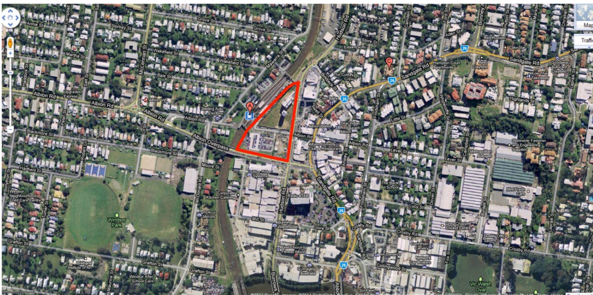
Location of Albion Mill Figure 1

FKP's is a property developer, engaged in construction, investment and management. Its main income sources are the retirement and residential divisions. 'The Mill', a 1.3 ha site, is located immediately adjacent to the Albion railway station, 4.8 km north of Brisbane's CBD (Figure 1).