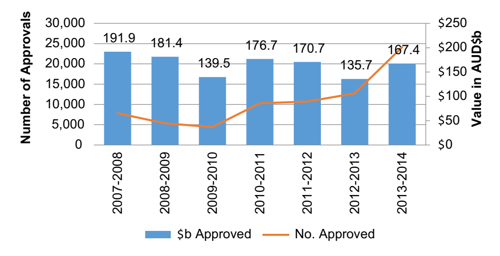
Figure 1. Foreign investment in Australia by approvals and value.

As outlined earlier, the Foreign Acquisitions & Takeovers Amendment Act , 2015 aims to increase dwelling supply while creating construction and other job opportunities (Australian Government, 2016a). Table 3 reflects this direction with an average of approximately 65% of all approvals over the five-year period being for new dwellings or their development. The "for development" category of real estate incorporates: vacant land on which dwelling construction must commence within 24 months; new dwellings already constructed; developer "off the plan" sales (usually of apartment/strata title style product); existing dwellings that will be subdivided and redeveloped with at least one additional dwelling; and annual programs (where an individual has an annual approval to purchase rather than specific to